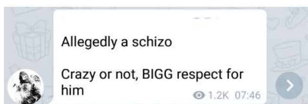
Members of a Far-Right extremist chat on Telegram commenting on the Hanau attack (1).